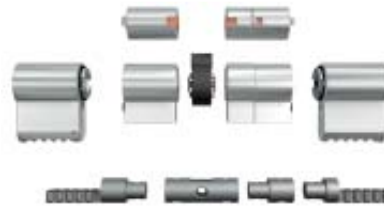
Fig.: Components of the modular system

The cylinder is available in both solid and modular design.